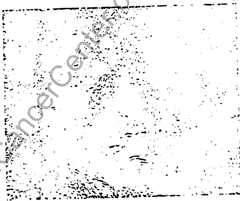
FIG. 5. EPIDERMOID CARCINOMA OF BRONCHUS AND LUNG. \times 125

The liver shows fibrous thickening of the capsule; fibrosis and lymphocytosis of moderate grade in the interlobular framework; patchy