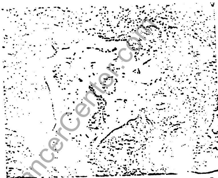
FIG. 4. CHRONIC BRONCHITIS AND BRONCHIECTASIS: "ASBESTOSIS" BODIES IN BRONCHIOLE. X 130

The lymph nodes at the root of the lungs are not conspicuous, a few moderately enlarged black nodes being found.